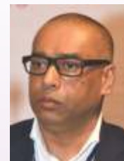
Shri Amlan Bora Trade & Investment Commissioner, Netherlands Business Support Office Ahmedabad